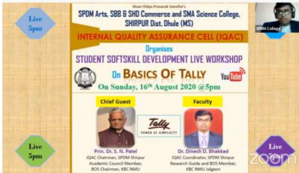
SPDM - Student SoftSkill Development Live Workshop - Basics of Tally

963 views • Streamed live on Aug 16, 2020